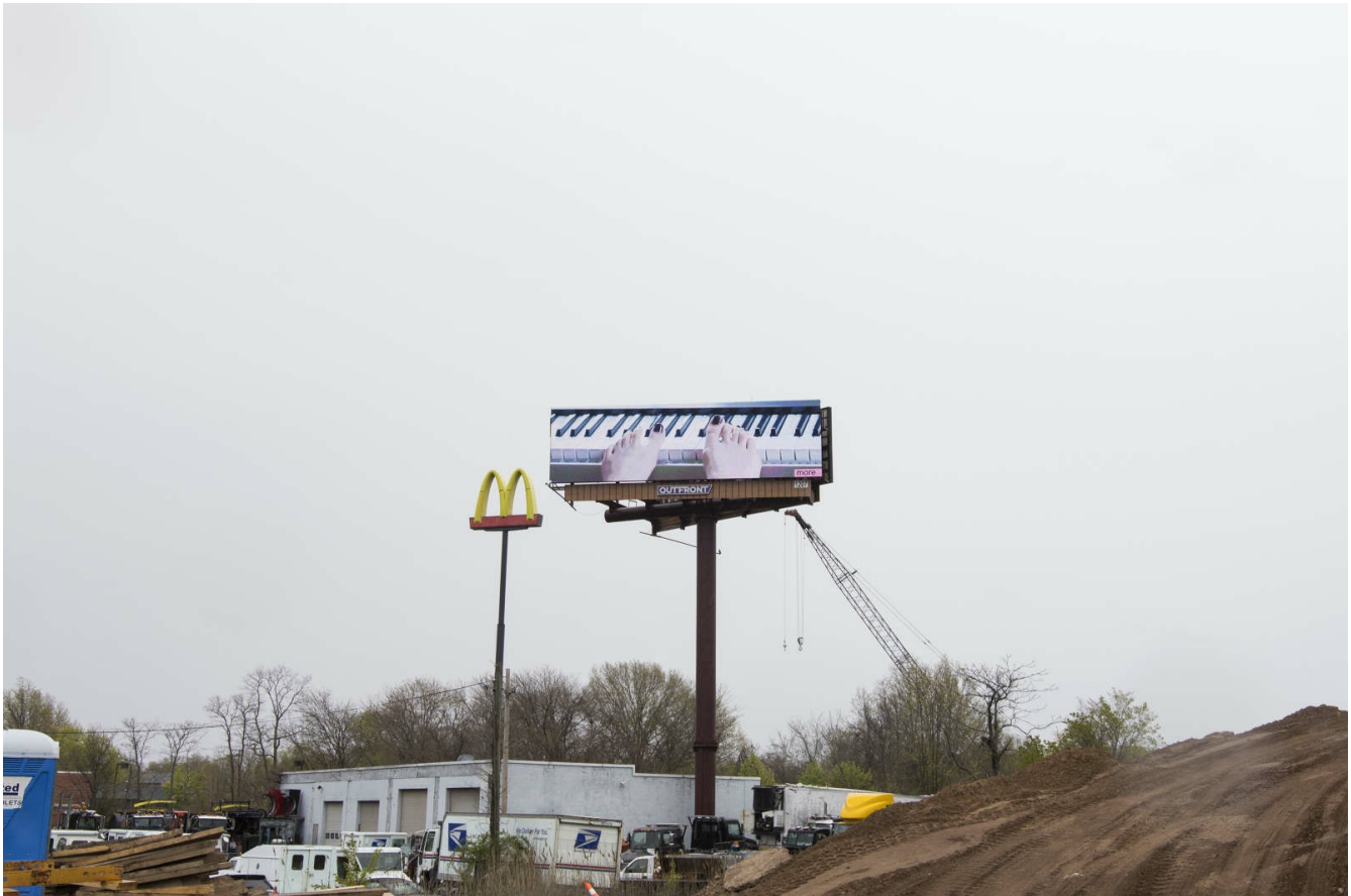
MORE Digital Billboard, 2016