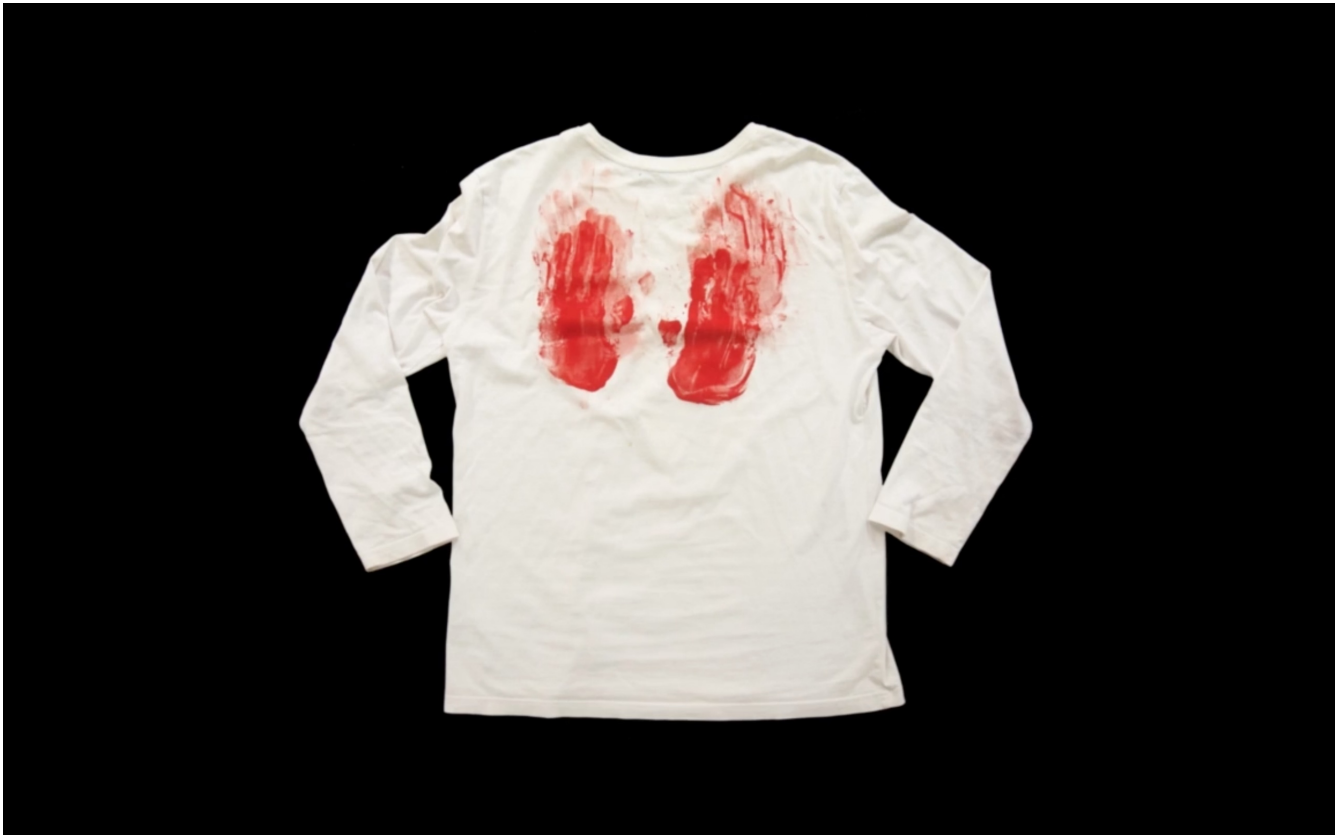
Still from Art Production Line , 2015

When I'm alone, I become more sensitive to my surroundings. I am more aware of my path, if I like the color of this building, or if I remember that dirty plastic bag floating under the sunshine and onto the mud. If I were with a group, I might not notice these things because you need to talk to people and follow the group. I like to have my own pace and rhythm and not worry about following or catching the group. When I'm alone, I feel like a human camera.